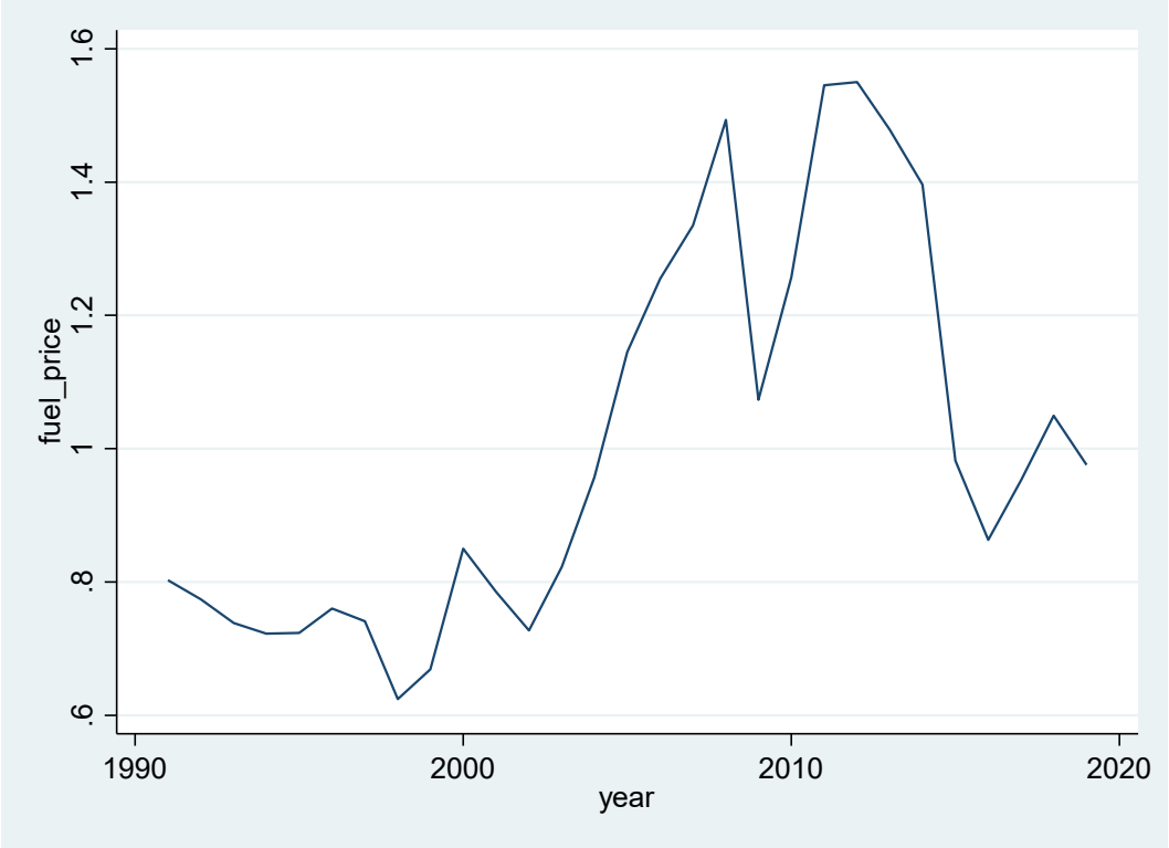
Figure 3: Real Aviation Fuel Price by Year